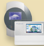
Solar-Log™ and Meteocontrol WEB'log Accessories