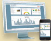
StecaGrid Portal Web portal